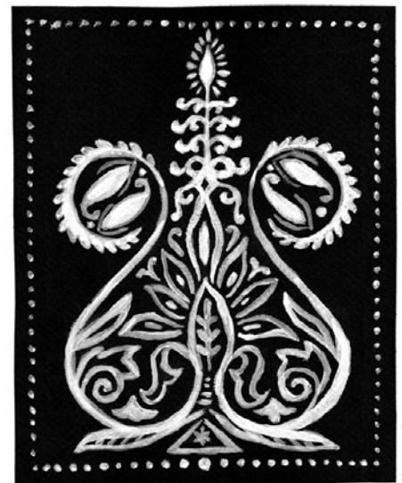
Illustration copyright © 2007 by Jamie Hogan

Visit Mitali’s Blog, Mitali’s Fire Escape , online at www.the-fire-escape.blogspot.com .