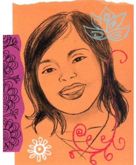
Illustration copyright © 2007 by Jamie Hogan